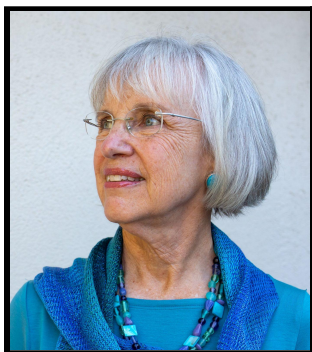
President of UU Mental Health Network